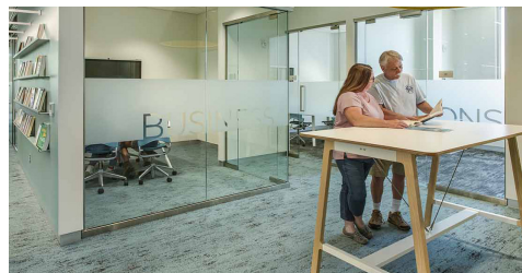
Entrepreneur and Business Centers