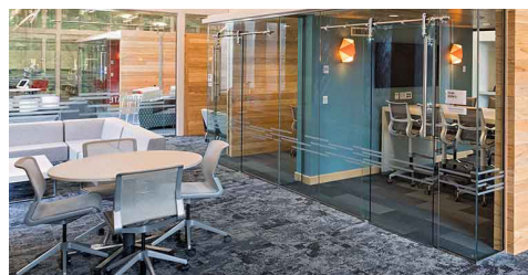
Expanded Resources Beyond Books