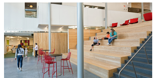
Versatile Community Spaces