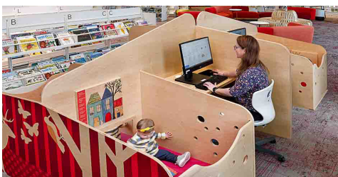
Inclusive and Safe Spaces