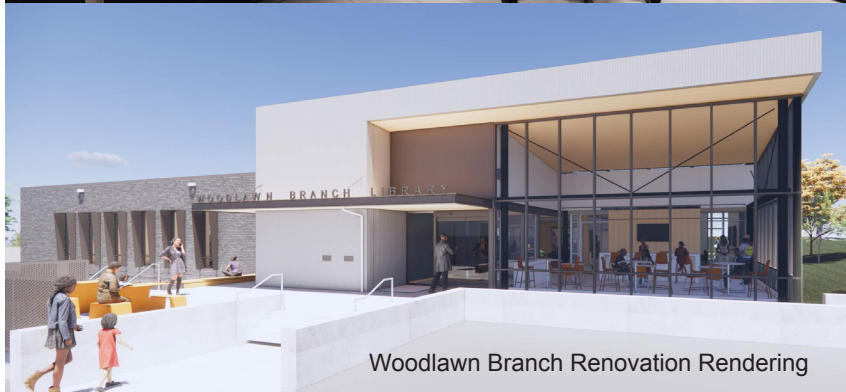
Woodlawn Branch Renovation Rendering