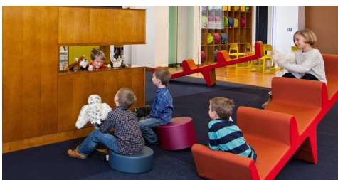
Early Childhood Learning