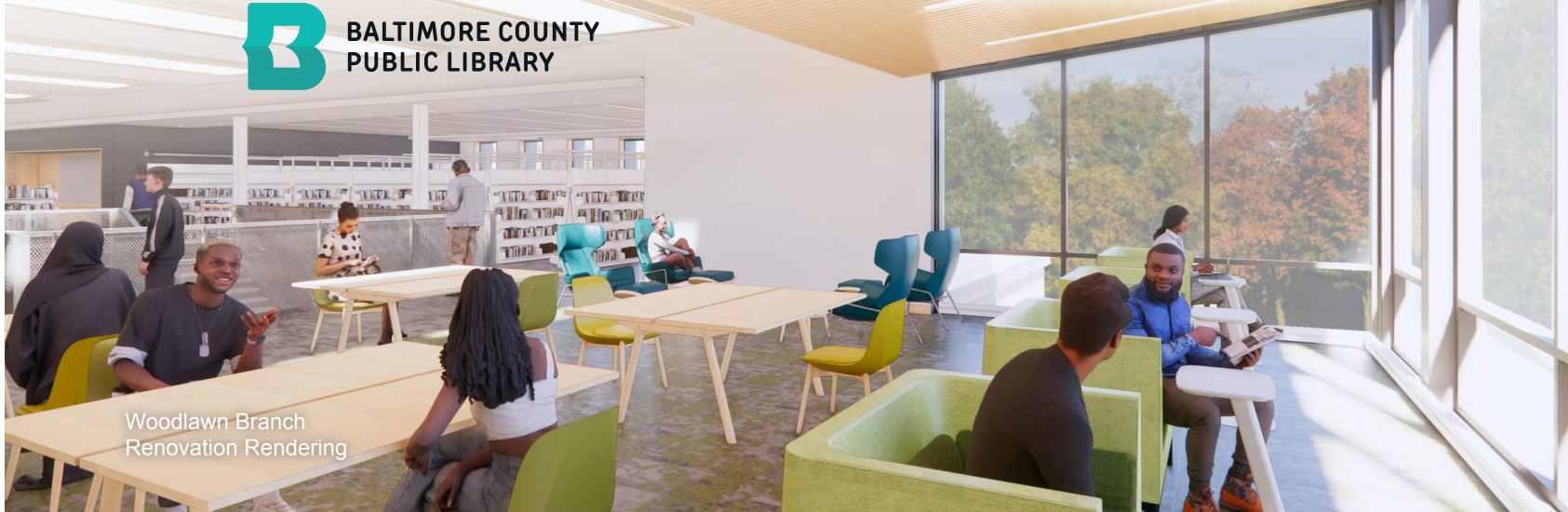
Woodlawn Branch Renovation Rendering