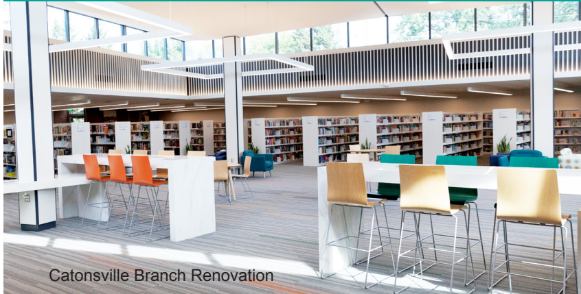
Catonsville Branch Renovation