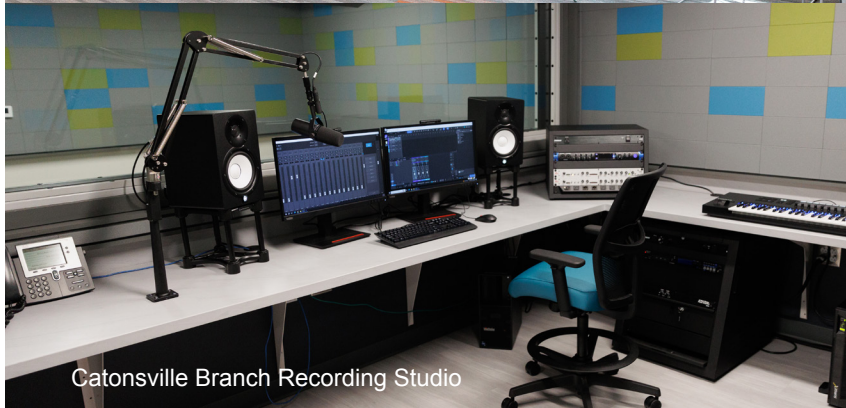
Catonsville Branch Recording Studio