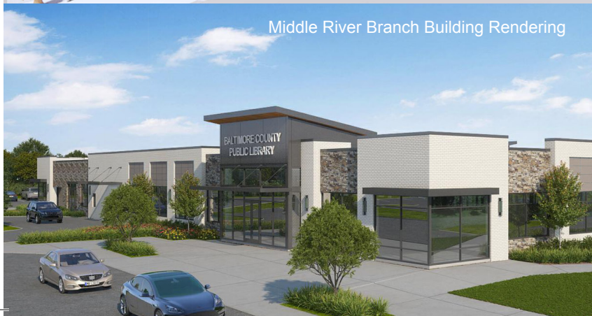
Middle River Branch Building Rendering