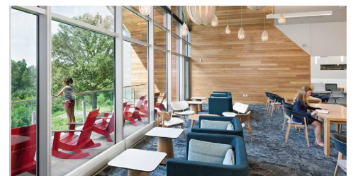
Sustainability and Accessibility

Pictures courtesy of Quinn Evans, the architectural firm for the $22 million Woodlawn Branch renovation and expansion coming in fall 2025 and the brand-new Essex Branch, located at 1517 Old Eastern Avenue.