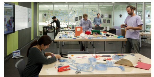
Learning and Skill Development Centers