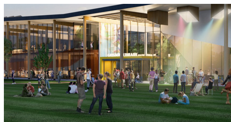
Community Engagement Hubs